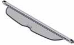
Illustration of the Cargo Cover in the Vehicle