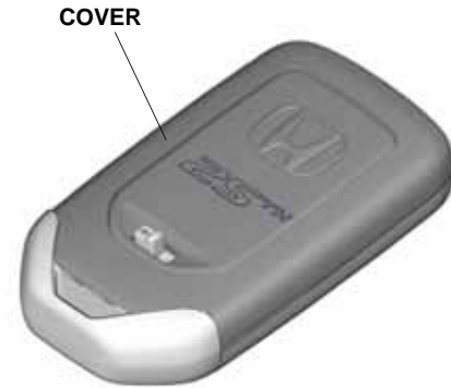
Illustration of the Smart Key Decoration